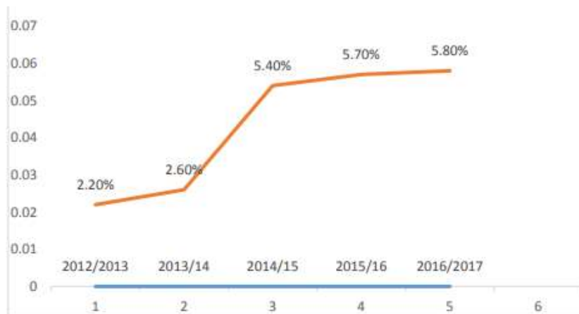
Figure 1. The magnitude of thyroid cancer among thyroid swellings in patients of JUMC over the past 5 years: from September 2012 to June 2017.